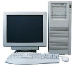
DOE Server (Not in our preview)